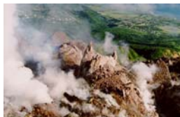
West Indies, Soufriere Hills Volcano, in January. At the base of these slopes, orchids abound...

All of these questions and more will be put before us,